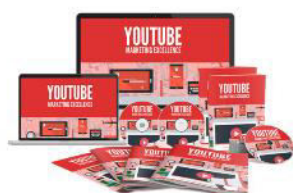
Youtube Marketing Excellence