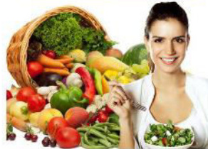
Eating Healthy Super Pack With Master Resale Rights