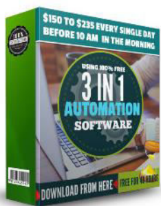
3 In One Traffic Automation Software