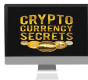
Crypto Currency Secrets