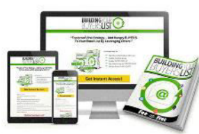
Build a Buyers' List