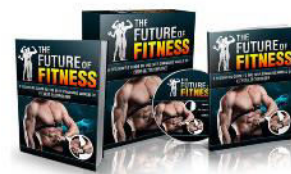
Wearable Tech-The Future of Fitness with